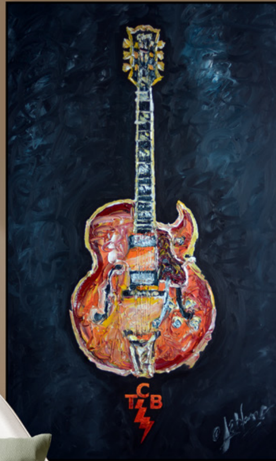
Gibson 400 CES TCB sur fond noir (36 x 60 in.)