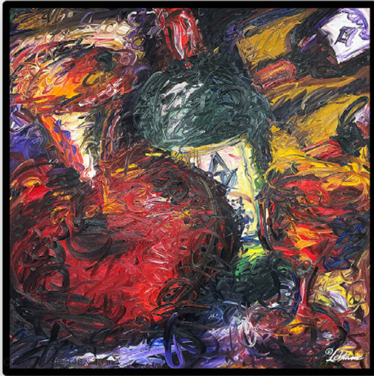
Cellier en fête (48 x 48 in.)