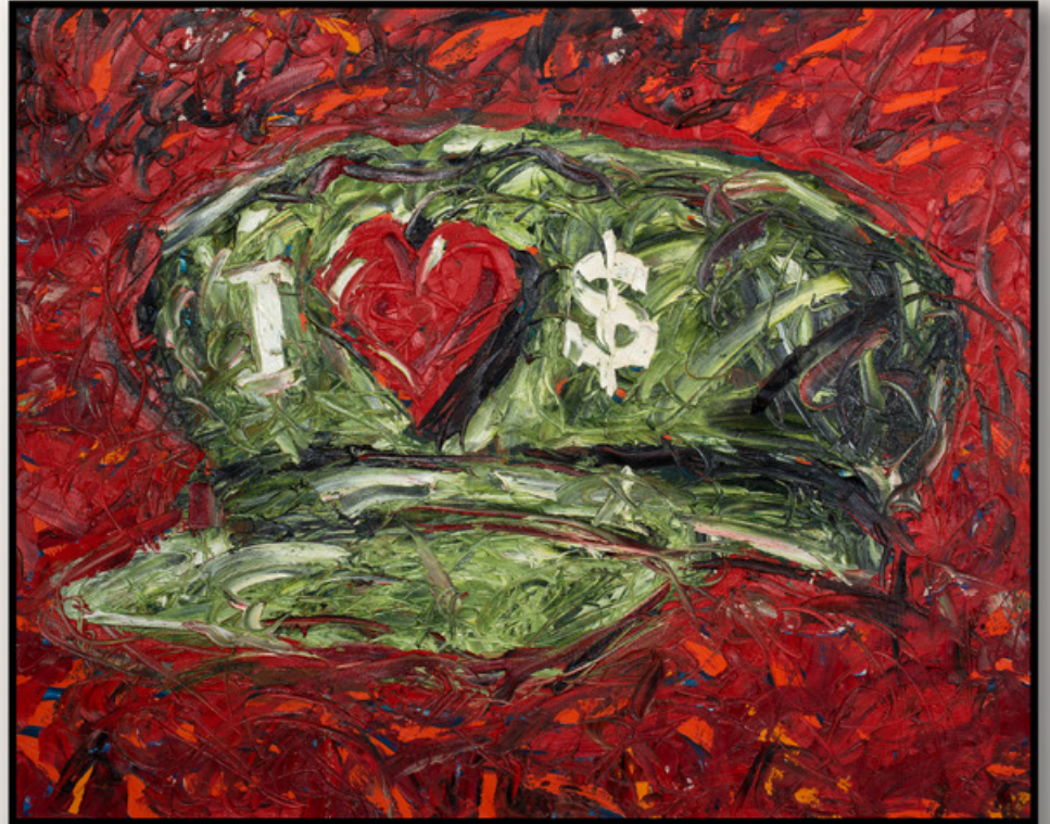
La gauche (60 x 48 in.)