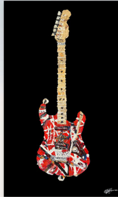
Frankenstrat (36 x 60 in.)