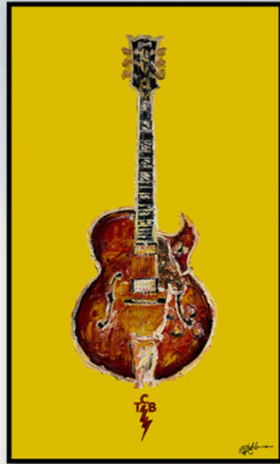
Gibson 400 CES sur fond jaune (36 x 60 in.)