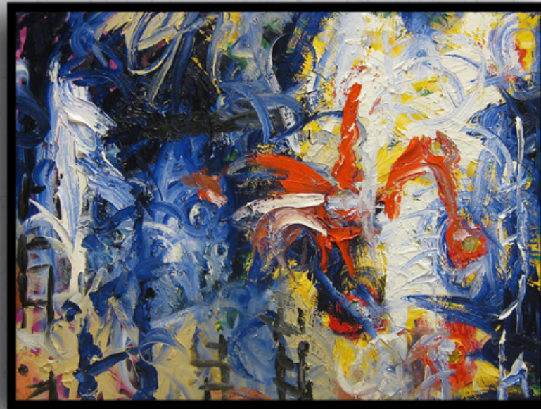
Popularité (48 x 36 in.)