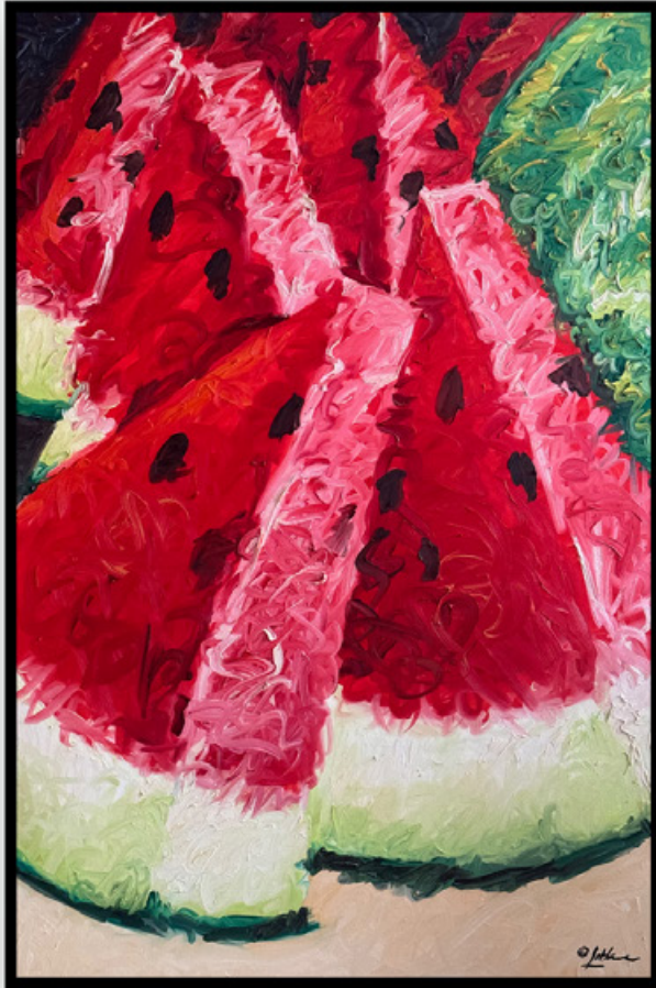
J'aime le melon d'eau (40 x 60 in.)