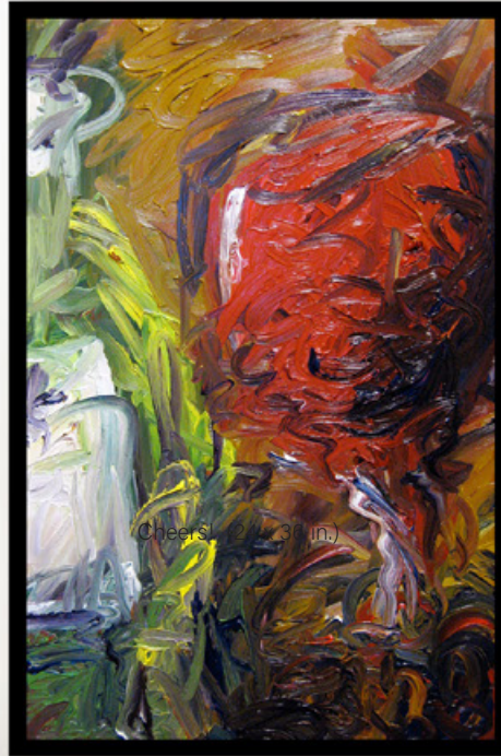
Cheers! (24 x 36 in.)