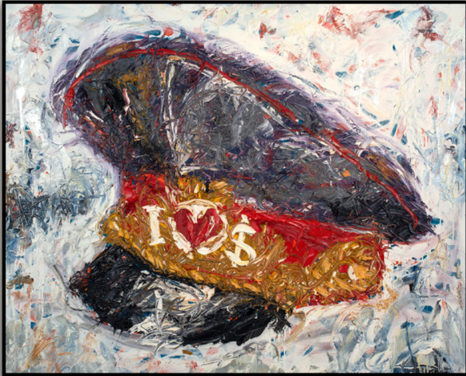
La droite (60 x 48 in.)