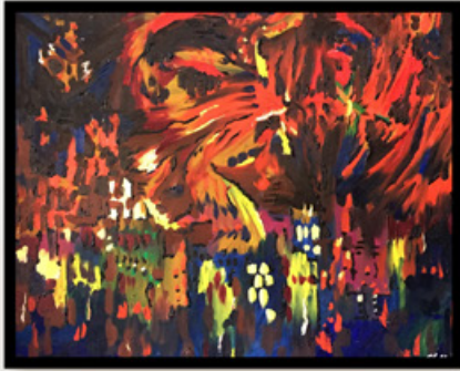
Le feu sacré de peindre (2010)