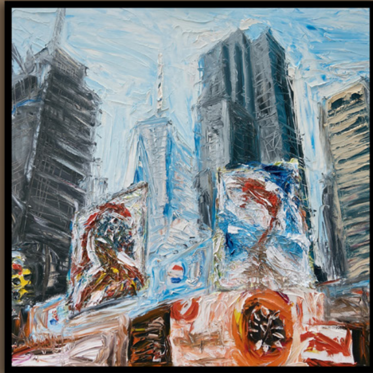
Leblanc sur Broadway (36 x 36 in.)