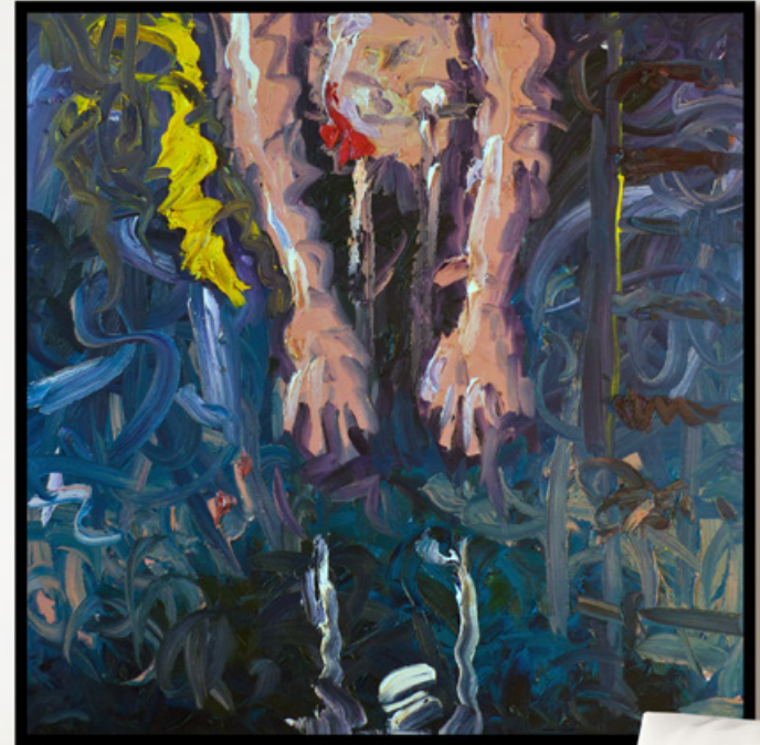
Confiance (48 x 48 in.) Can be hung both ways.