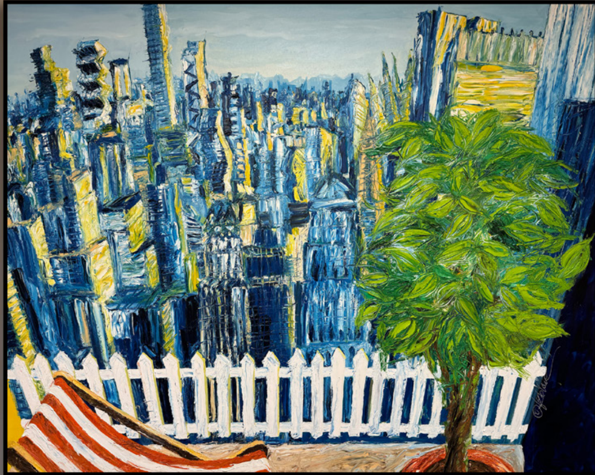
Balconville (84 x 67 in.)