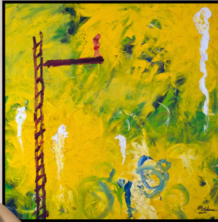
Décision (48 x 48 in.)