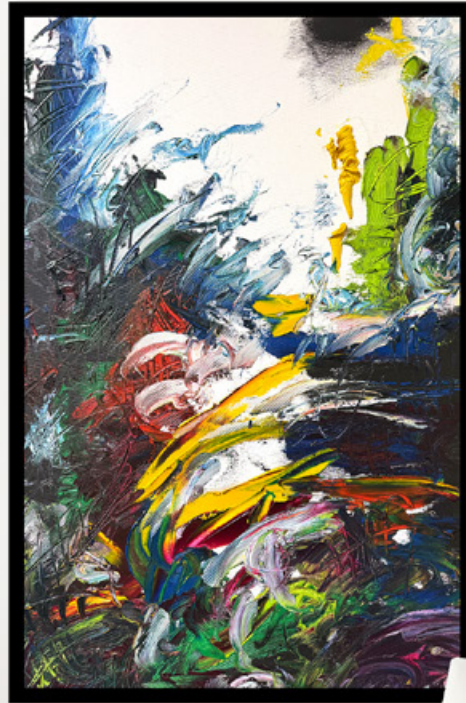
Changements climatiques (24 x 36 in.)