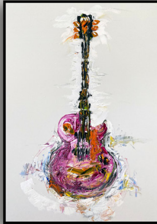
Guitare rose (40 x 60 in.)