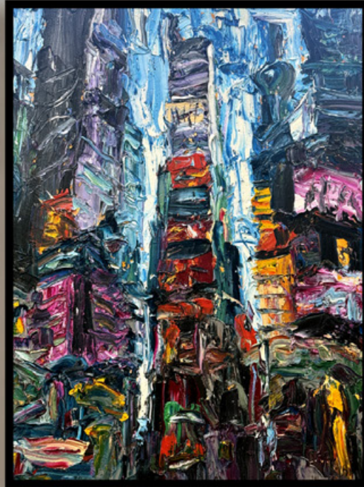
Times Square 2023 (36 x 48 in.)