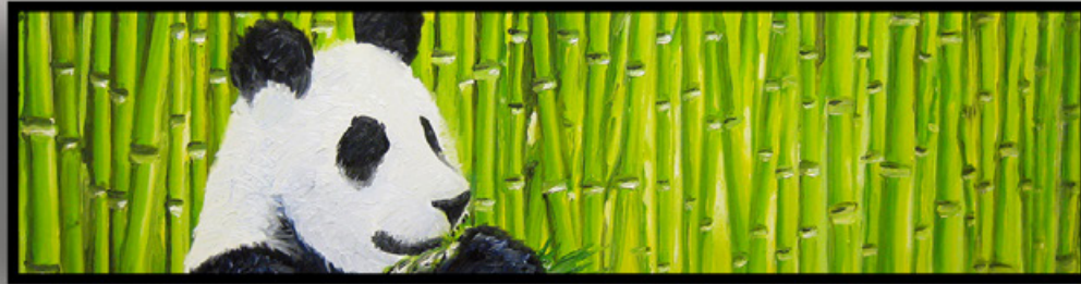
Bamboo Panda (48 x 12 in.)